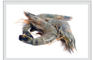
Black Tiger Prawns