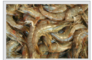
Fresh Water Prawns

IQF Cooked Crevettes Size: (10/20 - 30/40)